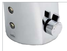
Inset: Optional temperature adjustment lever.