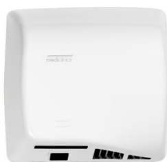
M17A/M17A-I White finish