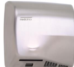
M17ACS/M17ACS-I Satin finish