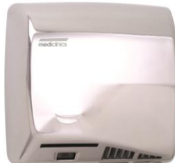
M17AC/M17AC-I Bright finish