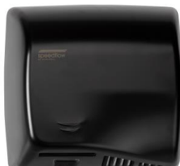
M17AB/M17AB-I Black finish