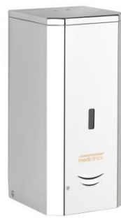
DJF0038AC Bright finish