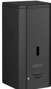
DJF0038AB Matte black epoxy finish