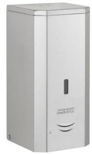
DJF0038ACS Satin finish